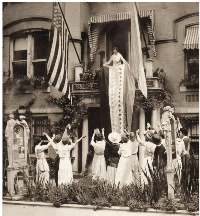
Suffragist Alice Paul leading celebration of Tennessee's ratification of the 19th Amendment.