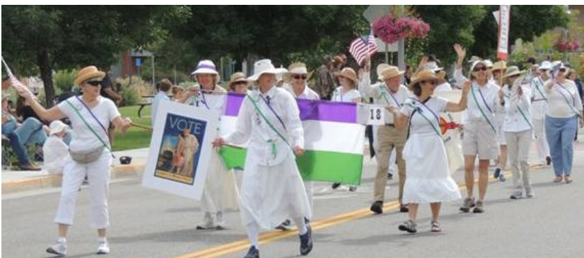
. Los Alamos Suffragists set off on the Rodeo Parade.

on technology use and applications, provided a social media workshop for members interested in improving their skills and access to Twitter, Facebook, Instagram or other technology and communication avenues commonly in use today.