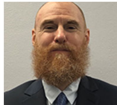
Brian Blalock, NM Secretary of Children, Youth and Families.

Blalock plunged into an account of his efforts during the 2019 legislative session. The department had six priority bills. His goal was to be totally non-partisan, to seek sponsors from both parties. He was very pleased that five of the bills passed. However, he stressed the need to convince legislators and the Legislative Finance Committee (LFC) that it's important to fund CYFD for community-based health services.