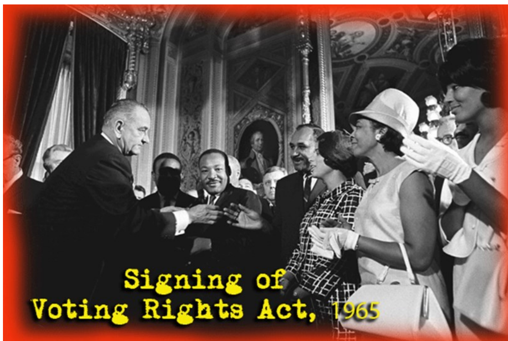
Signing of Voting Rights Act, 1965