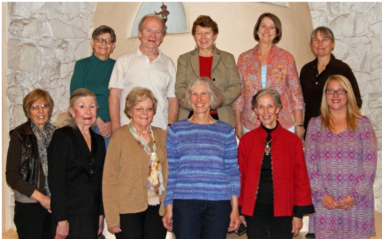
The LWVNM Board, 2015-2017