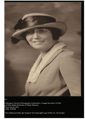
Nina Otero Warren, photo courtesy of NM state Archives

Nina Otero Warren was a member of the National Women's Party started by Alice Paul. She was instrumental in getting the Republican Party to support woman suffrage. Meanwhile her cousin Aurora Lucero and her family strongly supported the Democratic party, which had declared its support of women's voting rights. Otero Warren successfully lobbied Governor Larrazolo and state legislators to support ratification of the 19th Amendment. She is the only New Mexican and only Hispanic included among the most famous women in the suffrage movement. Her home, the Otero-Bergere House (now the Georgia O'Keeffe Research Center) at 135 Grant Ave. in Santa Fe is now a national landmark.