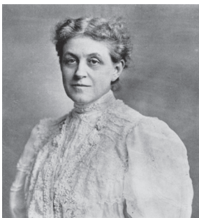
Carrie Chapman Catt

In her address to the National American Woman Suffrage Association's (NAWSA) 50th convention in St. Louis, Missouri, President Carrie Chapman Catt proposed the creation of a “league of women voters to finish the fight and aid in the reconstruction of the nation.” Women Voters was formed within the NAWSA, composed of the organizations in the states where suffrage had already been attained.