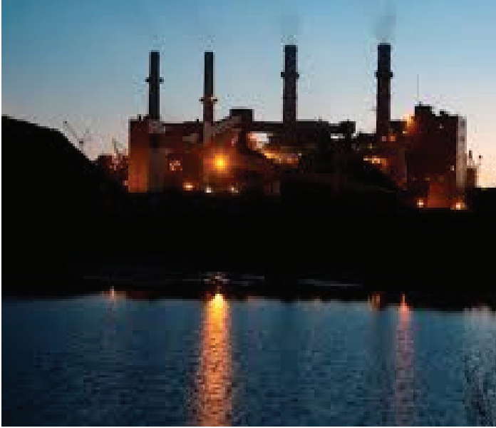
San Juan Generating Plant.