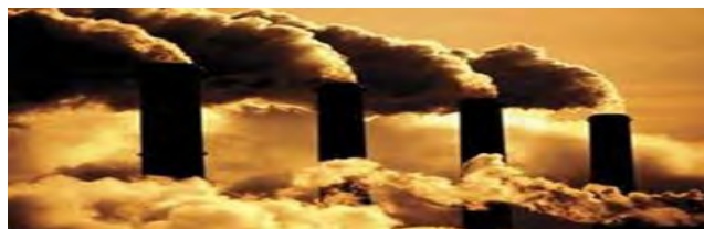
Coal-fired power plant

In November, PNM said it was considering the purchase of the San Juan Coal Mine, which supplies fuel for the coal-fired San Juan Generating Station (SJGS). The SJGS is subject to a separate hearing before the PRC on January 5, 2015. (See the Fall La Palabra for details.) The mine's coal contracts with the four companies that own SJGS expire in 2017, and many environmental organizations have urged that the mine be closed and that PNM replace the coal with cleaner fuels and more renewables. The owners want to know what their coal supply and price will be after 2017 before they agree to the closure of two units at SJGS. It is unclear whether they will have to have PRC approval for this.