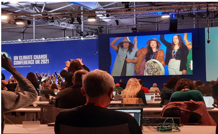
Listening to the Indigenous people speak at the plenary on the final day.

and motivating the grassroots to push our leaders onto the sustainable path.