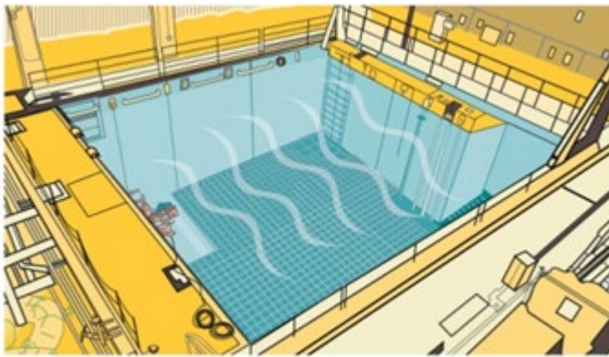
Spent fuel is placed in pools for storage

Pool Storage Every reactor site has at least one pool into which spent fuel is placed for storage when it is removed from the reactor. Spent fuel pools: