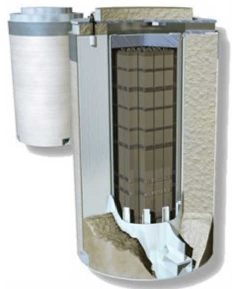
Dry casks have thick shielding to protect workers and the public from radiation

Inspections, monitoring, testing NRC inspectors ensure that spent fuel is stored safely by: